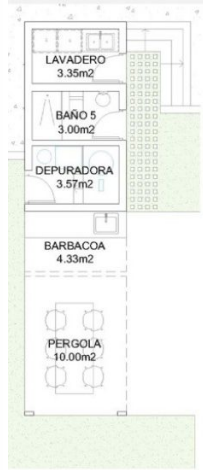
PLANTA BAJA EXTERIOR